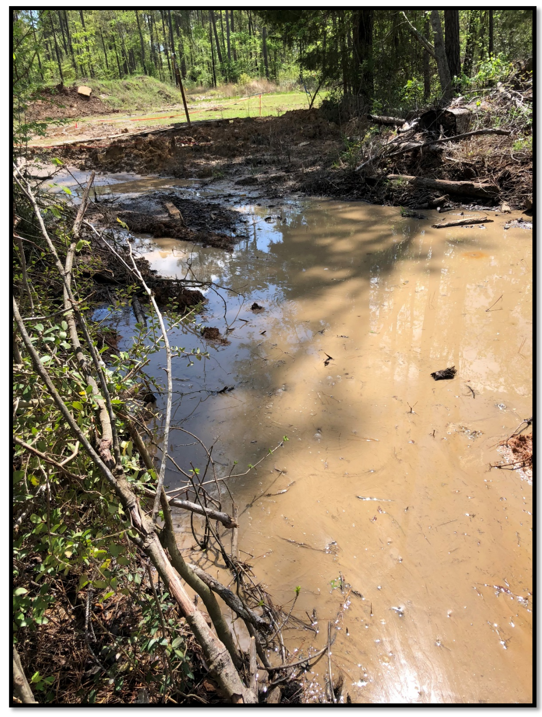
Photo #: 8394 – Photo Date: 3/29/2018 – Photo Time: 2:06 pm Between GPS Points 211 & 212 View Generally to the Southeast from near GPS Point 212

Light Brown Surface Sediments from the Bubbling/Aeration Down-Gradient (topographically) from GPS Points 207 & 208 at/near Steel Well Riser for Abandoned Well (Serial Number 158546)