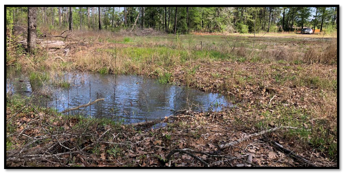
Photo Number 8378 – Photo Date: 3/29/2018 – Photo Time: 11:24 am – Photo By: Mark S. Moore GPS Points 214, 216, 217, 238 Photos Shows Sample Point W2 and Surface Water with Bubbling Throughout View Generally to the North-Northeast