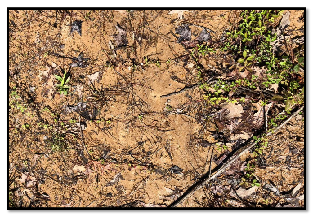
Photo #8383– Photo Date: 3/29/2018 – Photo Time: 11:31am – Photo By: Mark S. Moore Photo Shows Bubble/Air Holes from the Bubbling Action Near GPS Points 223, 224 & 238