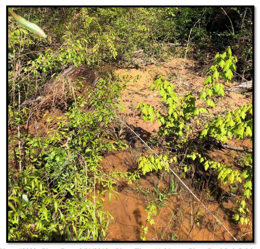
Photo #8380– Photo Date: 3/29/2018 – Photo Time: 11:25 am – Photo By: Mark S. Moore Photo Shows GPS Point 215 & Sample Points S3, W3 & A2; Light Brown Sediments From the Bubbling Action