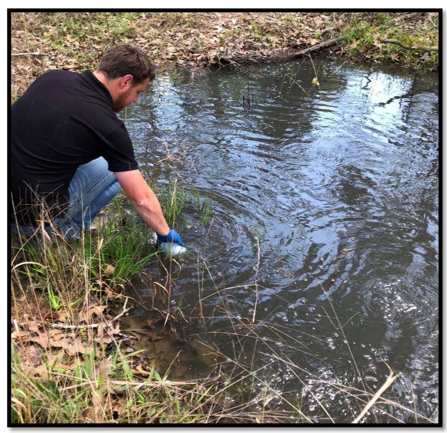
Photo #8403– Photo Date: 3/29/2018 – Photo Time: 2:40 pm – Photo By: Mark S. Moore GPS Point 214 Photo Shows Sample Point W2 and Bubbling in the Surface Water View Generally to the Southeast