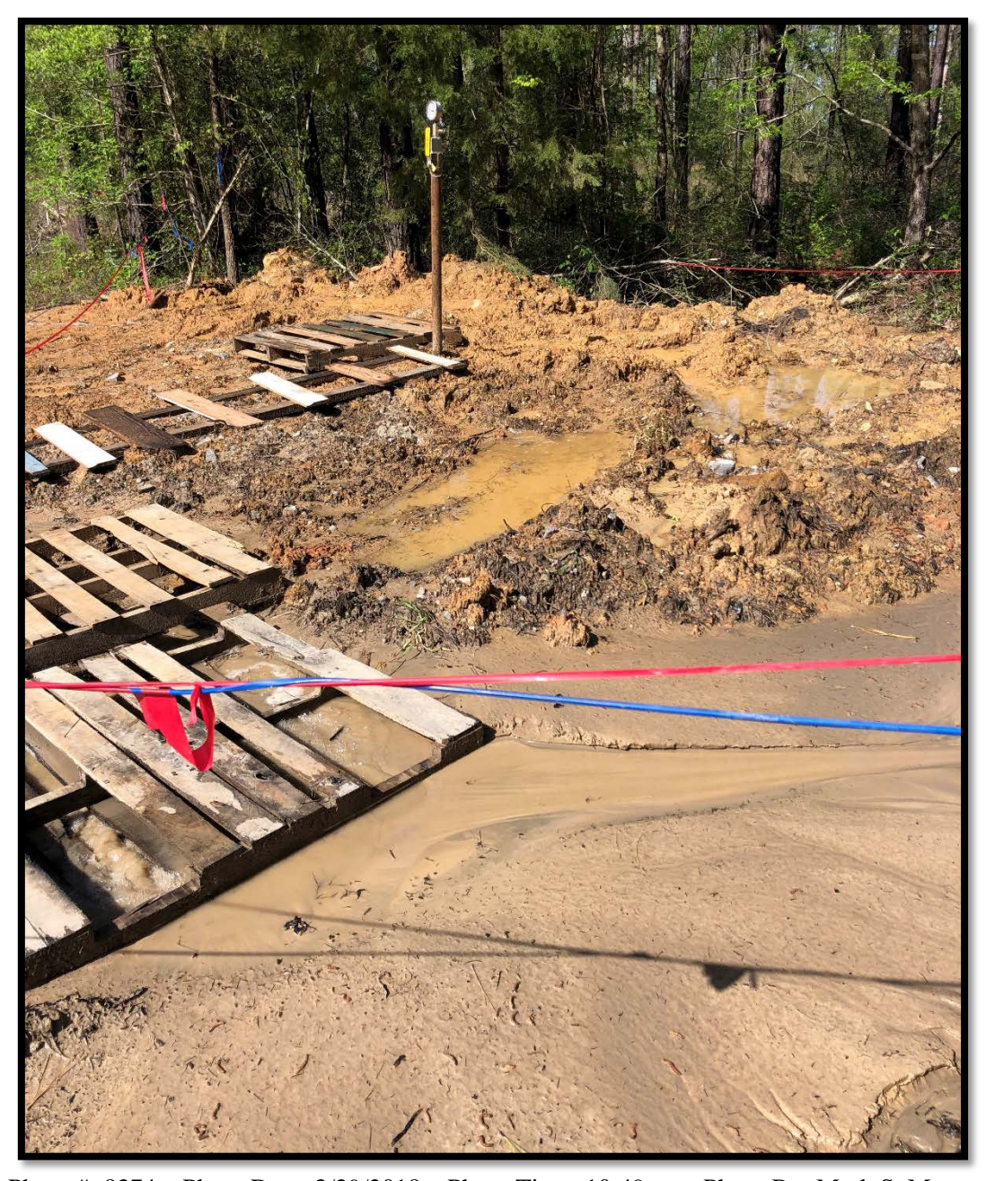
Photo #: 8374 – Photo Date: 3/29/2018 – Photo Time: 10:49am – Photo By: Mark S. Moore GPS Points 207 – 211 Sample Points for: S1, W1 & A1 View Generally to the West Surface Sediments from the Bubbling/Aeration Action at/near Steel Well Riser for Abandoned Well (Serial Number 158546)

The following photographs illustrate our findings during Approach Environmental's initial site visit (March 29, 2018) and our second site visit for air sampling (March 30, 2018).