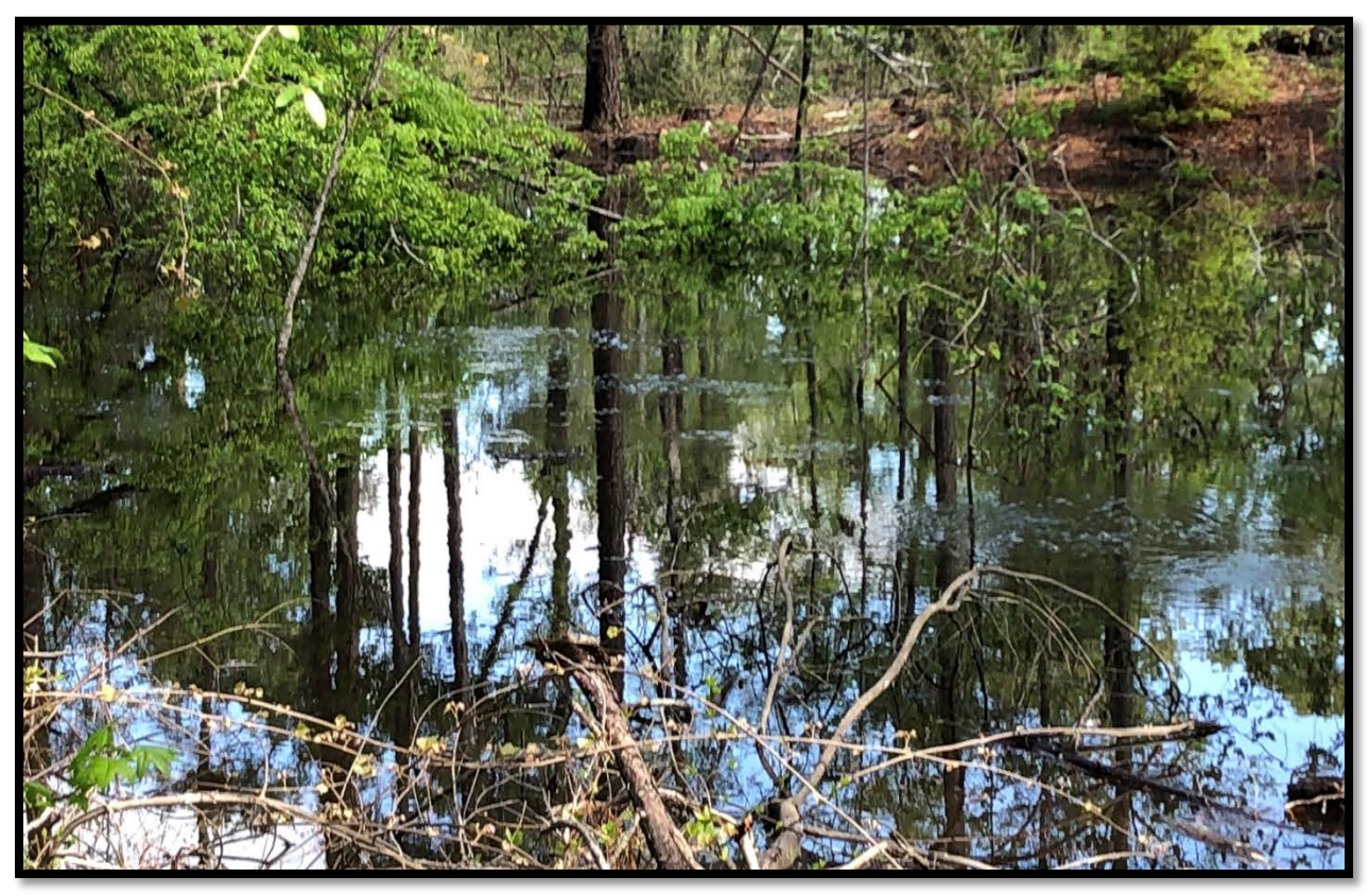
Photo #8375– Photo Date: 3/29/2018 – Photo Time: 11:10am – Photo By: Mark S. Moore Photo Shows Gas/Air Holes in the Pond Approximately 240' Southeast of Water Sample W2 and GPS Point 214