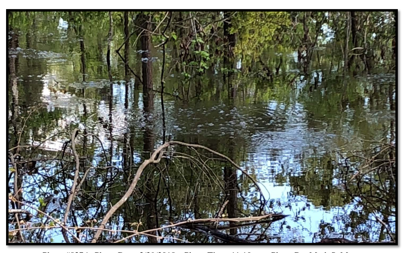
Photo #8376– Photo Date: 3/29/2018 – Photo Time: 11:10am – Photo By: Mark S. Moore Photo Shows Gas/Air Holes in the Pond Approximately 250' Southeast of Water Sample W2 and GPS Point 214