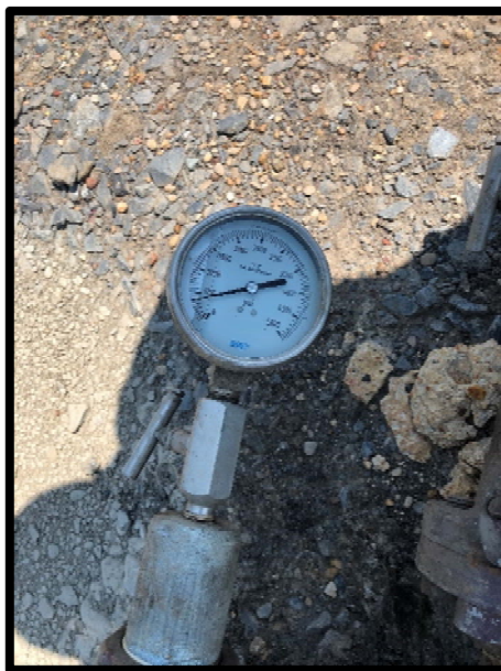
Gauge for well surface casing