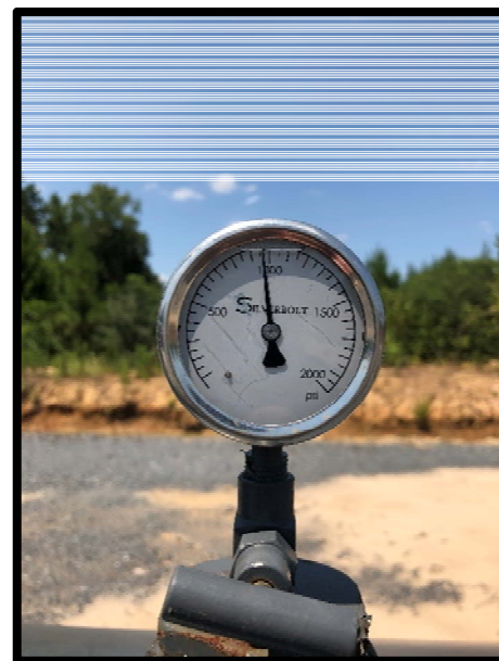
Gauge for well tubing