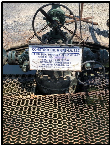
Derrick 21 HZ #2 Well Head