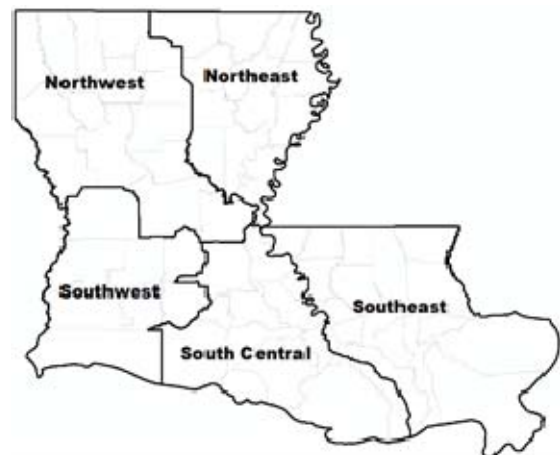
Figure 1. Statewide Flood Control Program Funding Districts for Rural Projects

D. Projects from sponsoring authorities seeking DOTD assistance in preparing applications will be scored and ranked with points awarded in the following manner.