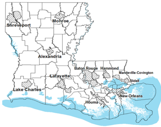
Figure 1. Statewide Flood Control Program Urban Areas Funding Group

5. Public Hearings (February-March). As part of the application evaluation process, the Joint Legislative Committee will hold public hearings in locations convenient to each funding district. The purpose of the hearings will be to receive comments from the public on the preliminary recommendations of the Evaluation Committee. After the hearings, the Evaluation Committee will incorporate public comments into its evaluation, complete the project evaluations, complete the project evaluations, and submit a priority ordered list of projects to the Joint Legislative Committee.