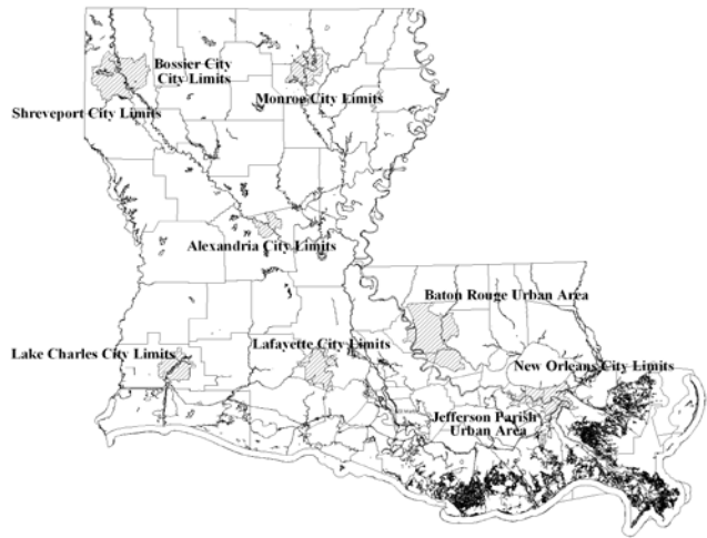
Figure 1. Statewide Flood Control Program Nine Urban Areas Funding Group

a. During this six month period, the Evaluation Committee will review and evaluate all completed applications in order to make recommendations to the Joint Legislative Committee on Transportation, Highways, and Public Works for funding. Applications will be divided into urban and rural categories. Applications for projects in the nine major urban areas comprise the urban category, as shown in the Figure 1, and compete against all other urban projects for funding. All other applications will be grouped by funding district as shown in Figure 2. Rural projects are subdivided into two categories, rural-developed and rural-undeveloped. Rural-undeveloped projects compete only against other rural-undeveloped projects in the same funding district and likewise for rural-developed projects. Proposed projects will be evaluated and ranked based on criteria established by the Evaluation Committee.