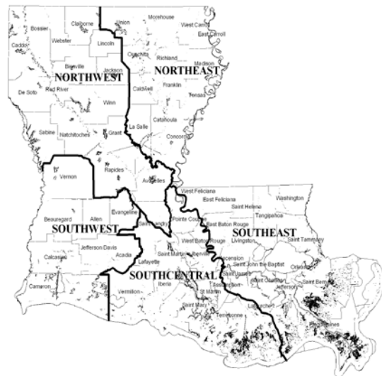
Figure 2. Statewide Flood Control Program Five Funding Districts for Rural Projects

b. Projects recommended to the Joint Legislative Committee will include a mix of those occurring in rural-undeveloped and rural-developed areas within each funding district as well as those for urban areas of the state. The method for allocating funding percentages within each district and the method for allocating total program funds to the various districts are presented in Subchapter D, Evaluation of Proposed Projects and Distribution of Funds.