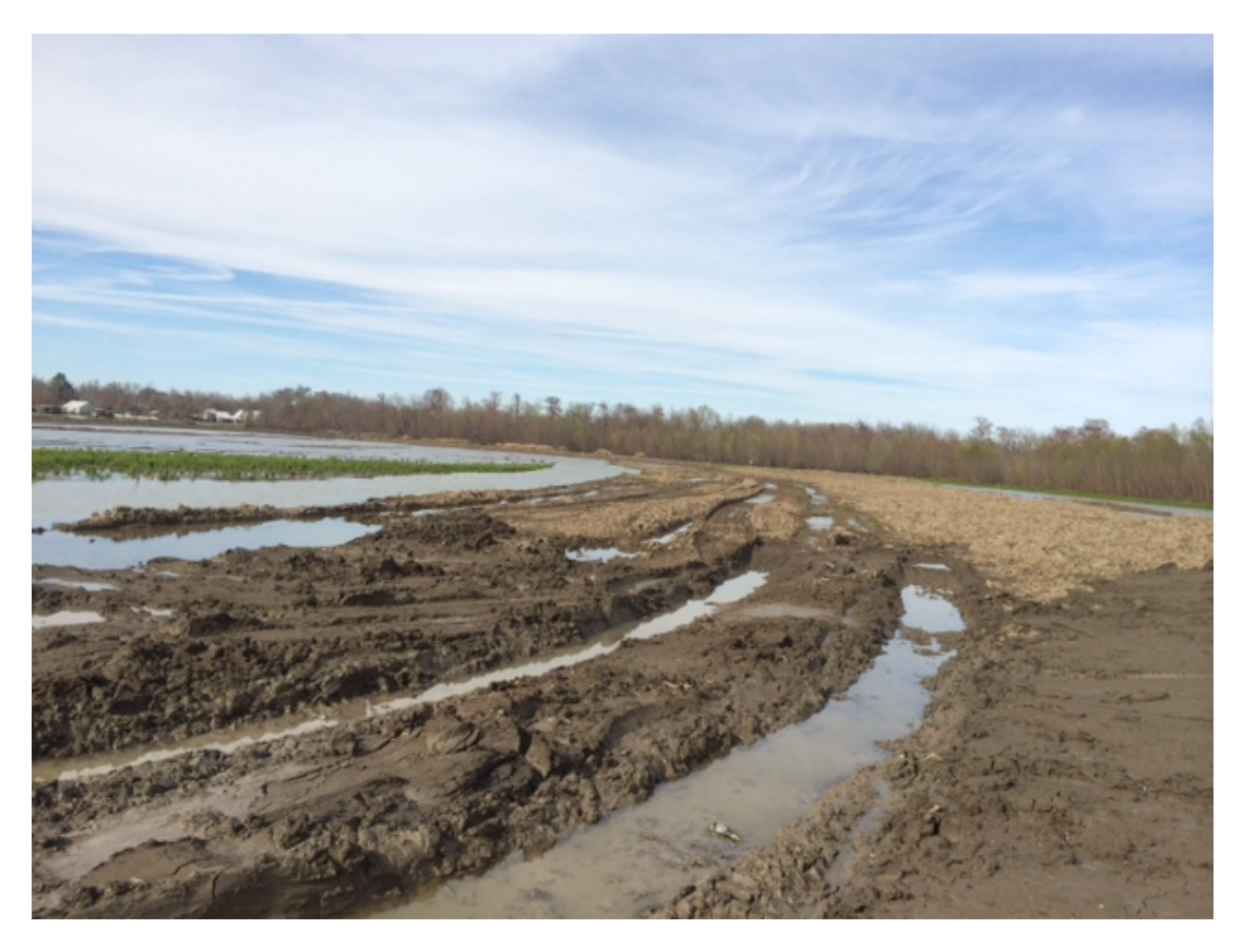
Interior Area of Containment Dike – March 7, 2015