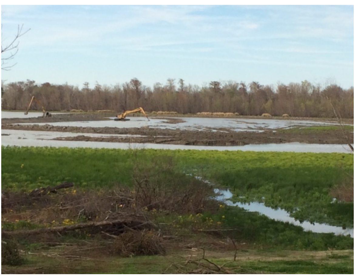
Constructing Western Section of Containment Dike – March 7, 2015

Completed Section of Dike on Eastern Side – March 7, 2015