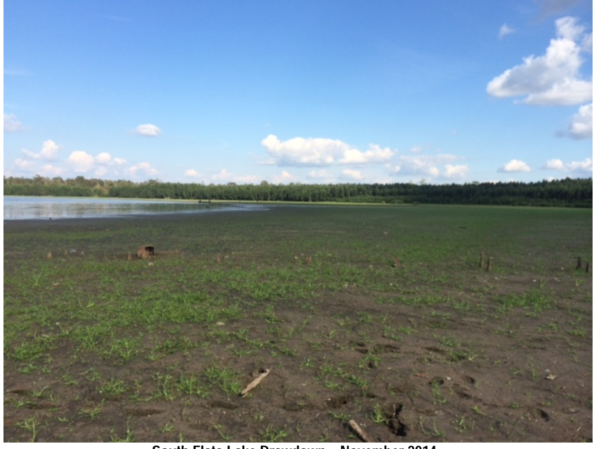
South Flats Lake Drawdown - November 2014