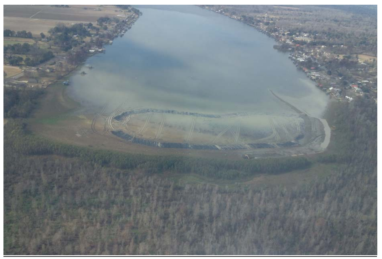
showing Layout of Geotextile Fabric and Beginning of Dike Construction - December 11, 2014