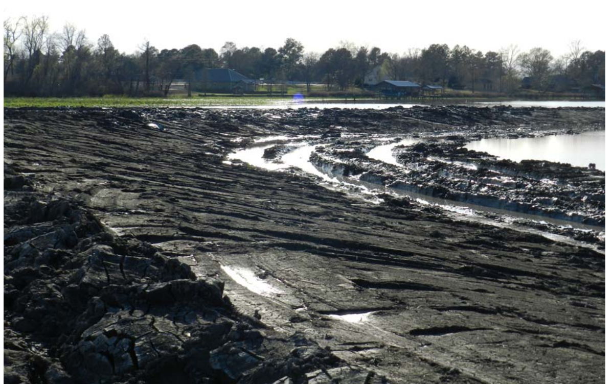
Interior Area of Containment Dike – March 7, 2015