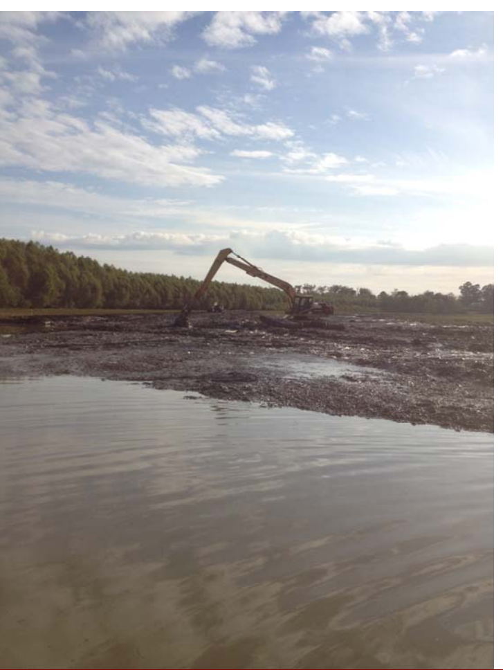
Early Stages of Containment Dike Construction