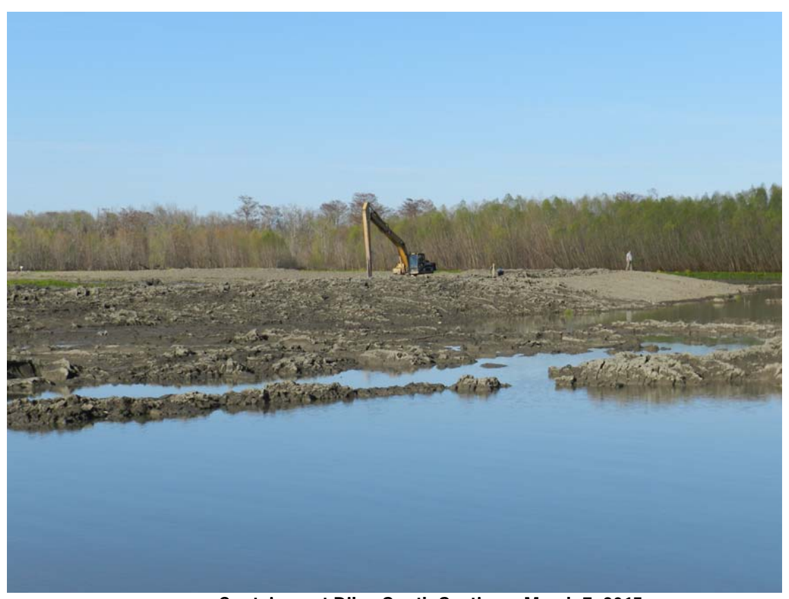
Containment Dike, South Section – March 7, 2015