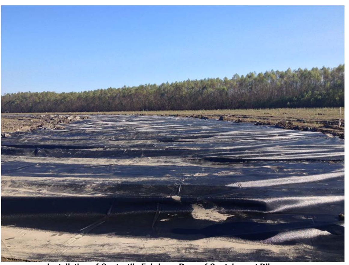
Installation of Geotextile Fabric on Base of Containment Dike December 7, 2014