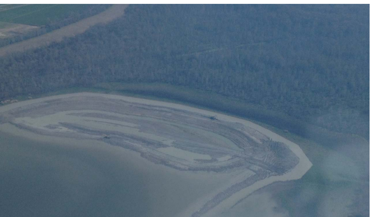
Aerial Photography RLB Contracting – February 2015