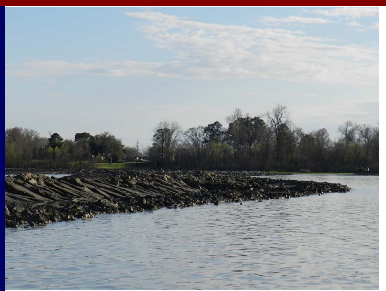
Containment Dike Section on the Western (Lake) Side of Project – March 7, 2015