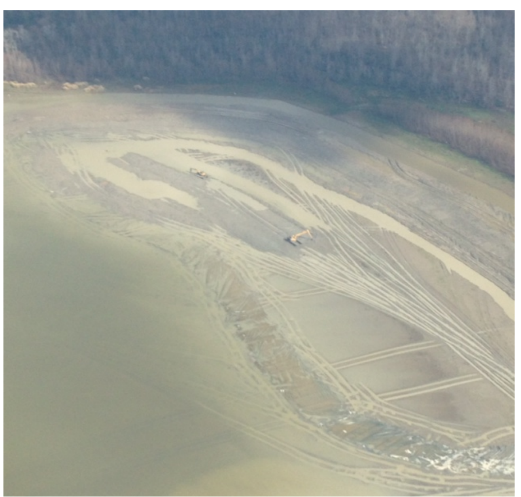
January 20, 2015