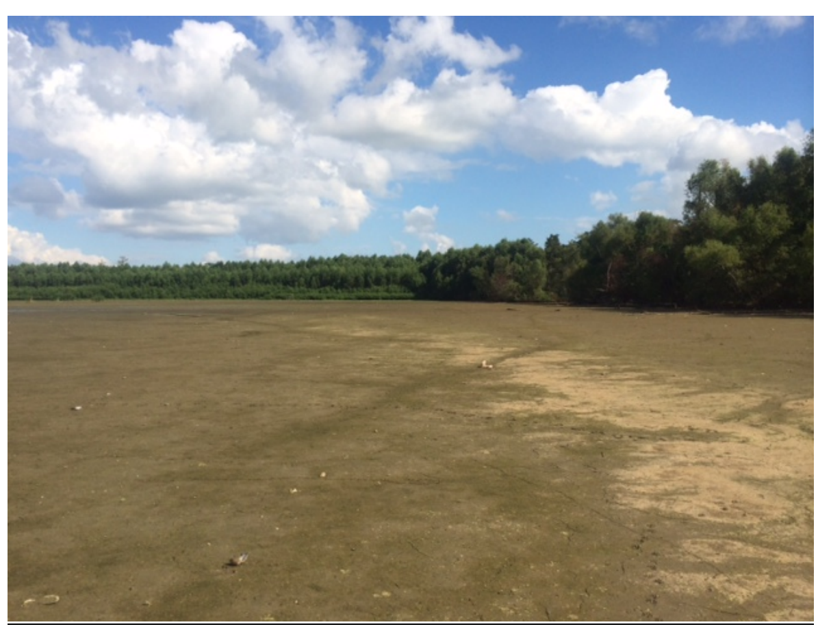
South Flats Lake Drawdown – October 2014