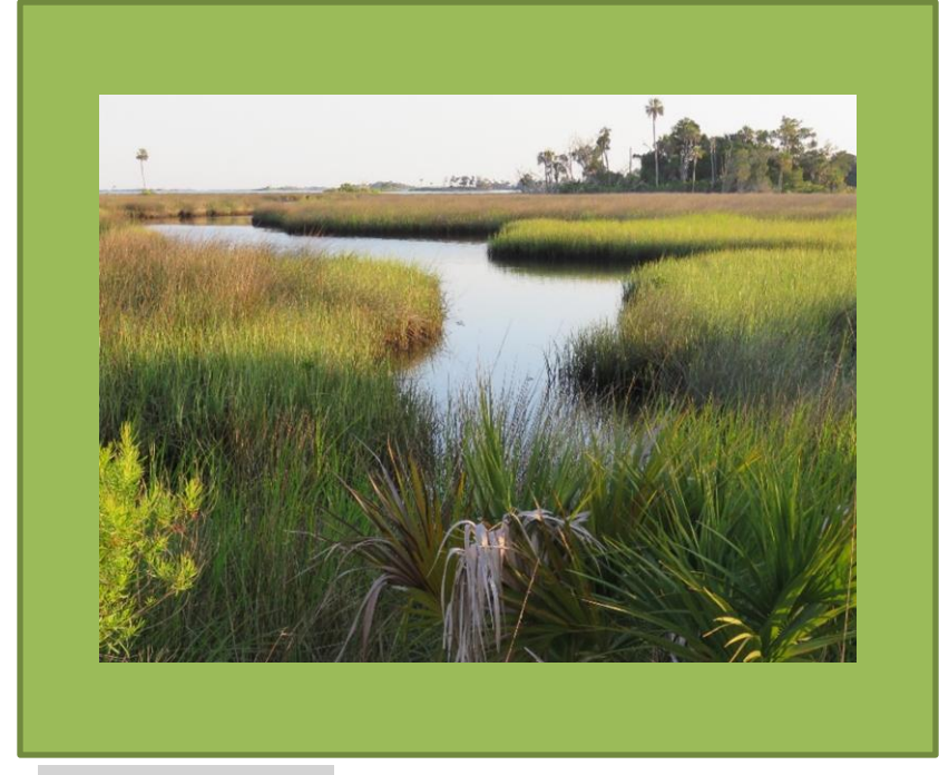
Texas Coastal Marsh

For assistance or information on scheduling Louisiana coastal training or workshops, you can also contact Jon Truxillo at: <a href="mailto:jon.truxillo@la.gov">jon.truxillo@la.gov</a> or 225-342-3394.