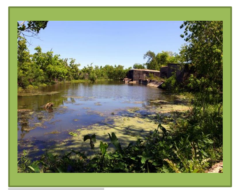
Fort St. Phillip, Louisiana