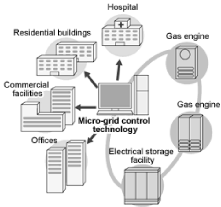
Micro-Grid System – Urban