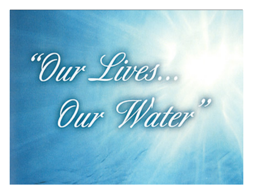
DNR Award Winning Water Conservation Video - 2008