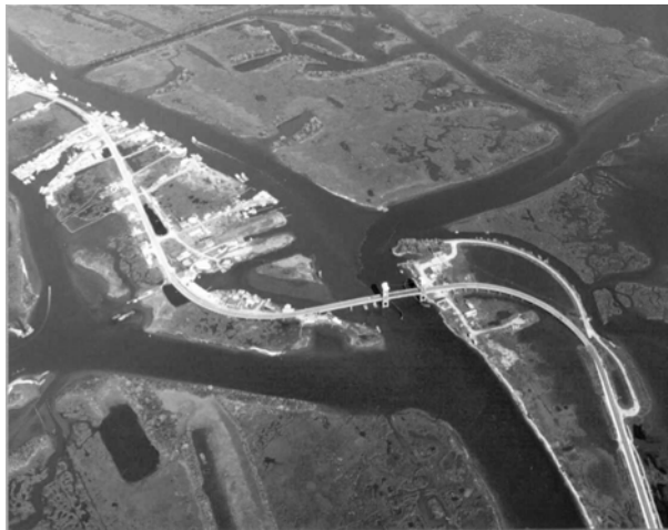
Leeville Bridge the “weakest link” in the supply chain to Port Fourchon.

The U.S Minerals Management Service (MMS) projects that there will be 10-to-21 billion barrels of oil and 40-to-60 trillion cubic feet of natural gas discovered on just the federal leases licensed for development over the next 5 years. That is enough energy to fuel every commercial and private vehicle in America for two-to-five years and heat, cool and run appliances in every home in America for two-to-three years. In order to meet these energy milestones, key energy infrastructure will have to be sustained, and even upgraded.