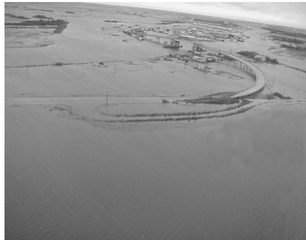
LA 1 and Leeville after a minimal Tropical Storm