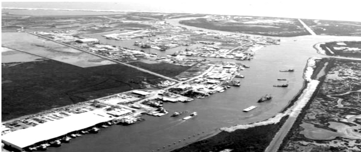
Aerial view of Port Fourchon, America's Energy Port

Few people recognize that, as expansive as Coastal Louisiana is, there are only two corridors that provide road access to the Gulf of Mexico, the Lafourche Corridor and another in extreme Southwest Louisiana in the Cameron-Holly Beach area. This limited highway connectivity to the Gulf, and proximity to this nation's major offshore oil and gas fields, has resulted in unprecedented development of Port Fourchon into the premiere intermodal base for support of an increasingly significant amount of this nation's hydrocarbon supply.