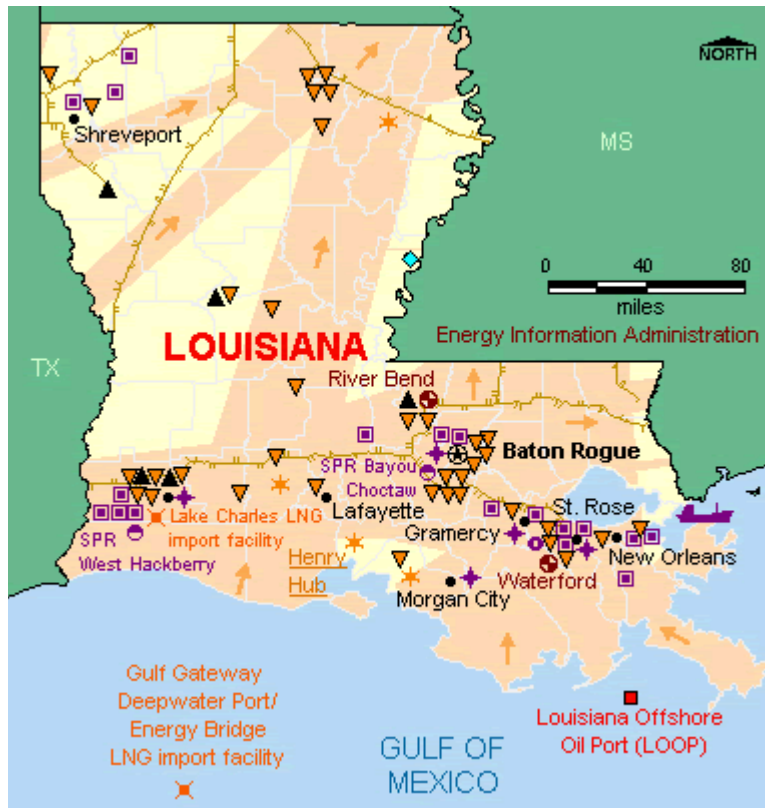
Figure 2. Major Electric Power Plants in Louisiana

Entergy has not decided to build a nuclear unit, but it is positioning itself to have the option to build a nuclear unit. Entergy Nuclear has signed a project development agreement with GE-Hitachi Nuclear to order reactor components and is on schedule to submit a combined construction and operating license application for its Grand Gulf nuclear site in Mississippi by the end of 2007 and a second application for its River Bend site in Louisiana in mid-2008. 1