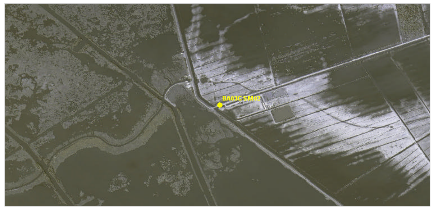
Reproduced from Louisiana 2005 DOQQ