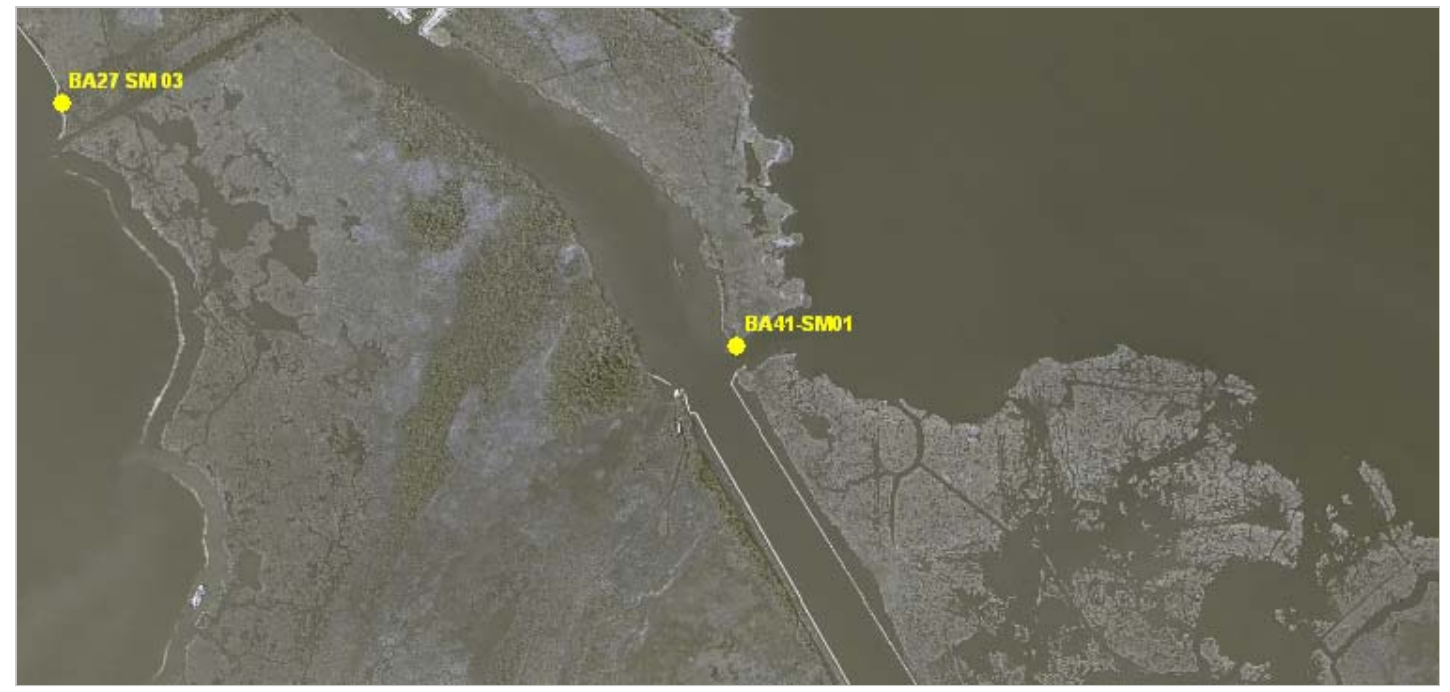
Reproduced from Louisiana 2005 DOQQ