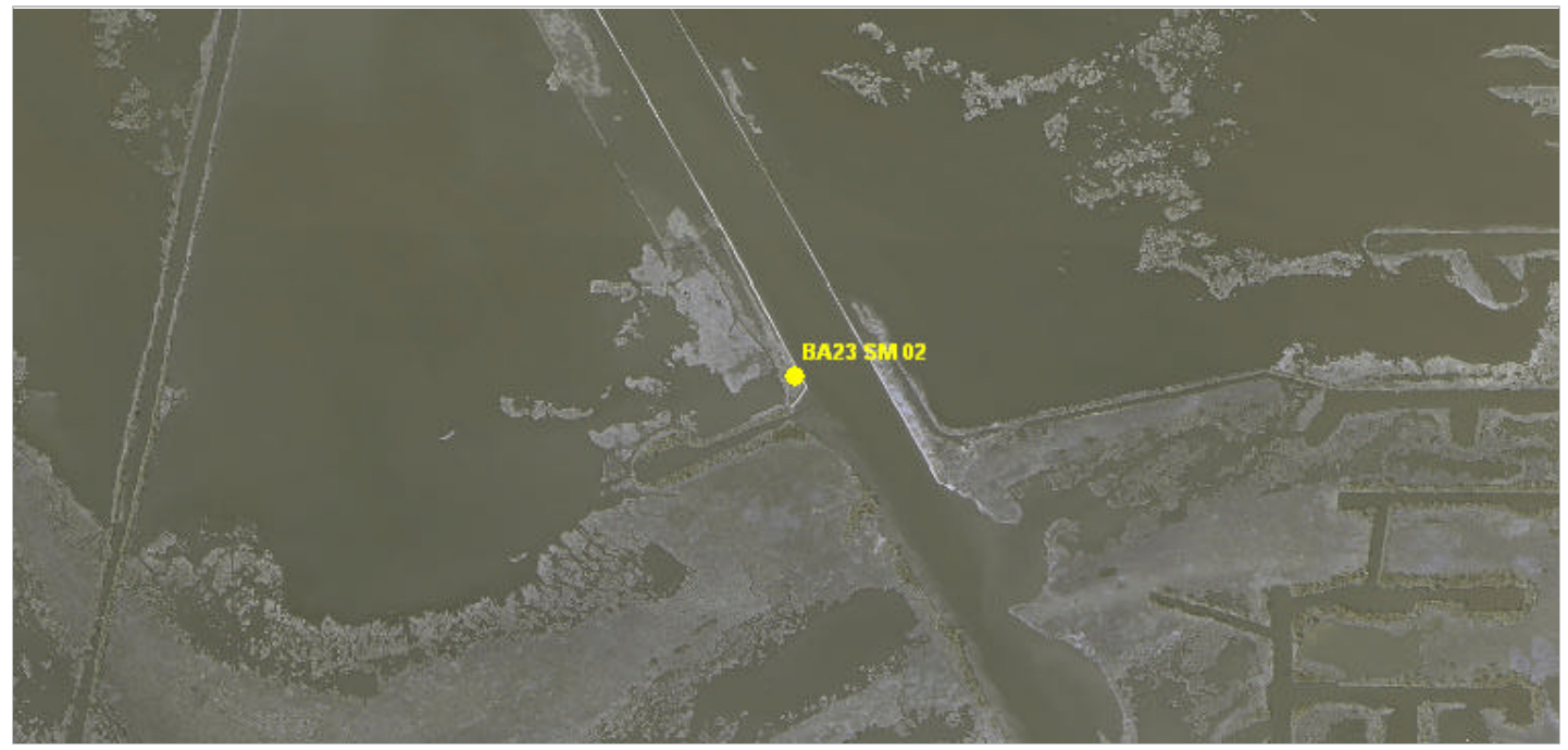
Reproduced from Louisiana 2005 DOQQ